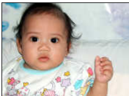
One very sweet girl.