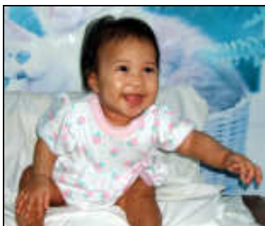
How can you resist this girl??!!